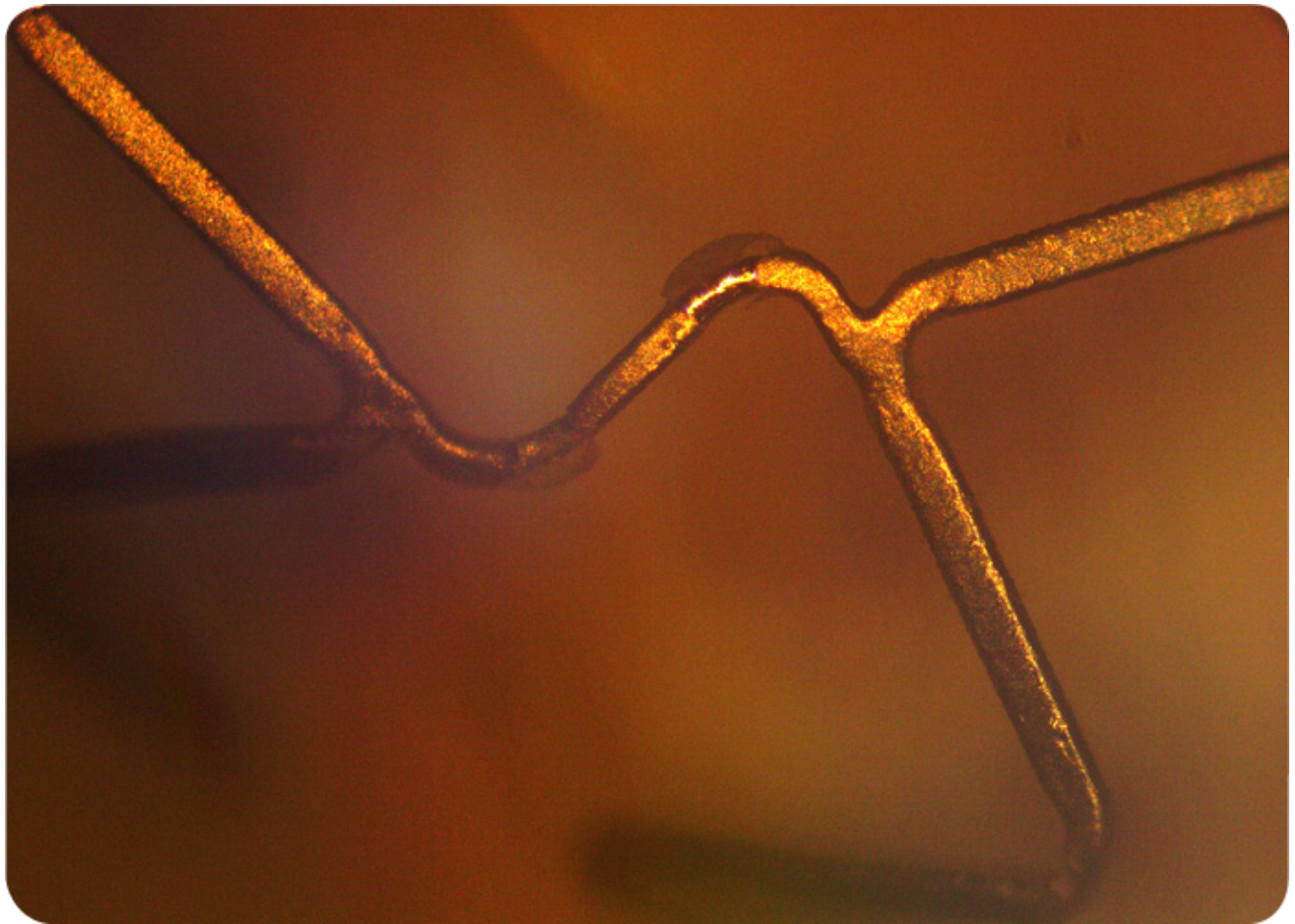
Fig. 1. Blistering of stent coating, 40x