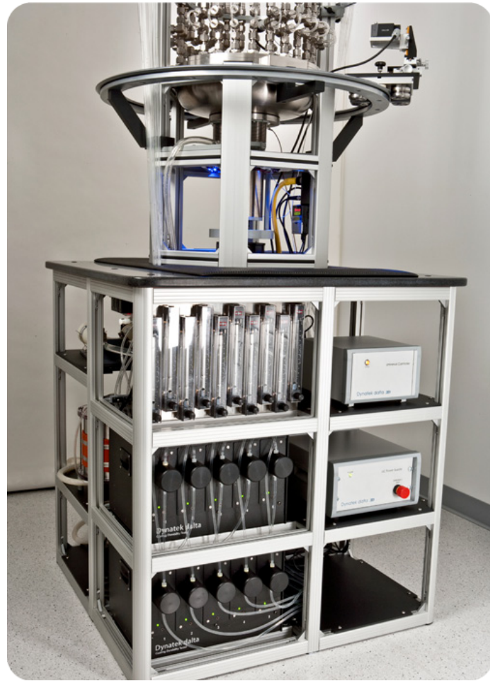
Fig. 3: CDT-20 Coating Durability Tester, using 4 particle counters (2 located in the front, 2 located in the back) for a total of 20 sensors, one for each sample.