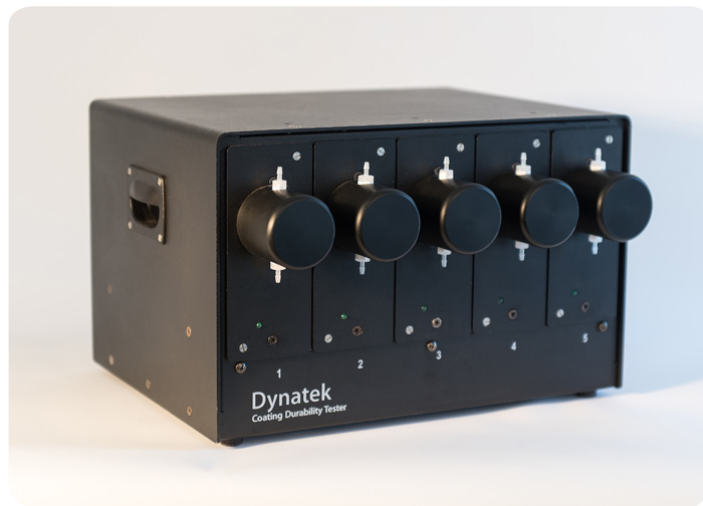
Fig. 1: Five-sensor particle counter unit.

Finally it is common knowledge that the beaker method presents a difficult challenge to comply with USP 788 and other standards when validating required particulate recovery with standardized particle injections.