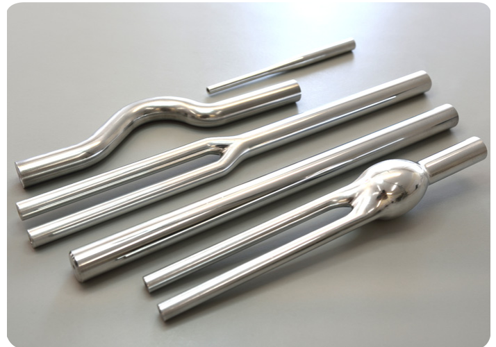
Mandrels used for silicone dipping

Dynatek measures the compliance and ID of mock vessels as part of our QA process on our proprietary Dynamic Compliance Tester (DCT) to ensure that they are consistent with the guidelines of ISO 7198. All mock vessels shipped to customers include a certification of vessel properties indicating the % radial compliance at a specific pressure, frequency and temperature.